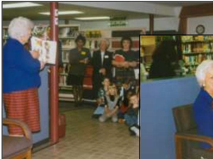
Image 4.7: Former First Lady Barbara Bush participated in a fund-raising campaign organized by the Whitehouse Community Library's librarian. Schoolchildren within the community competed with each other for the chance to listen to Mrs. Bush read several books at library. Proceeds from the competition's various fund-raising efforts were utilized to benefit several community programs.

wide variety of library patrons including young children and senior citizens. The Staff also participate in various community activities such as parades and Keep Whitehouse Beautiful. In addition to the existing summer reading program, the