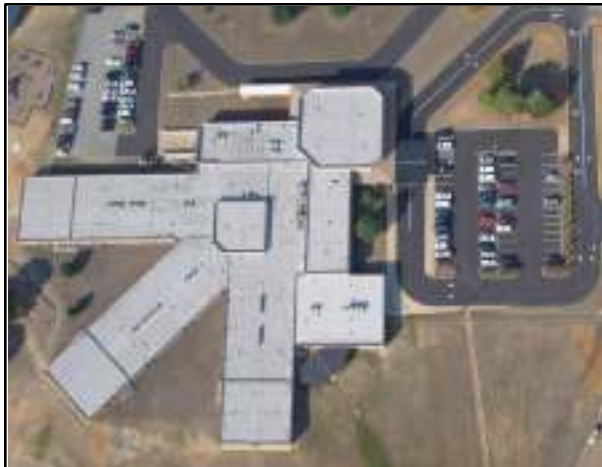
Image 4.9: Gus Winston Cain Elementary School houses Kindergarten and first-grade students.