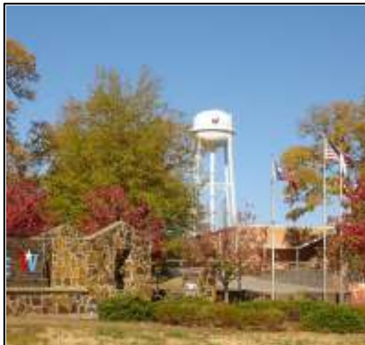
Image 4.1: The City's primary elevated storage tank as viewed from Main Street (above) and State Highway 110 (right). Whitehouse maintains two other elevated tanks located in the northern and southern portions of City's CCN area.

Three elevated storage tanks are maintained by the City both in and out of the City Limits, resulting in sufficient water pressure for urban development and fire protection. These facilities have a combined capacity of just under 1 million gallons. Three ground storage tanks are also maintained by the City with a combined