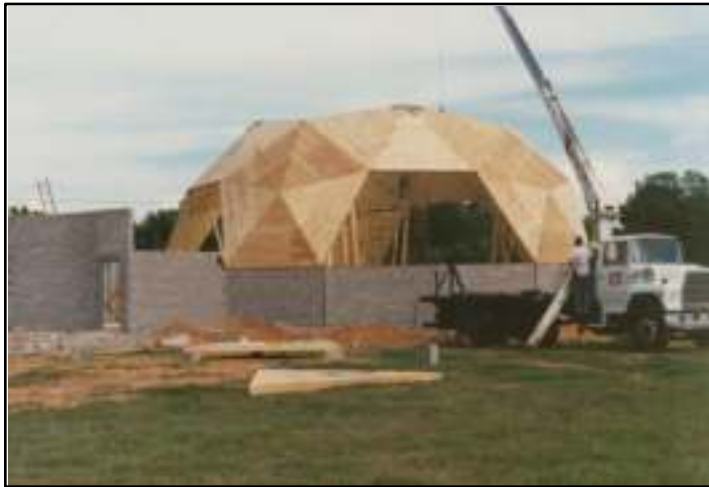
Image 4.8: The library's original dome (under construction above) was intended to be the first of three such structures. In order to serve a growing community the library will need to physically expand its facilities proportionate to the City's population growth.

At present the Library is exhibiting between 22 and 23 thousand volumes. The building's design will only allow for minor growth of the collection. As a result of the anticipated community growth, physical expansion of the facility, and the addition of new educational programs by the Library within the life