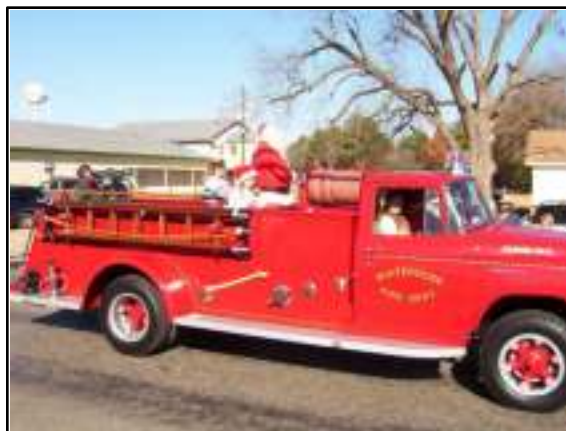
Image 4.2: Engine #1 was the first truck used by the Whitehouse Volunteer Fire Department and is still driven for special events such as YesterYear and at the Christmas parade.

Whitehouse facilities. The comparisons rate the number of facilities divided by municipal population in thousands. The Department currently exceeds national