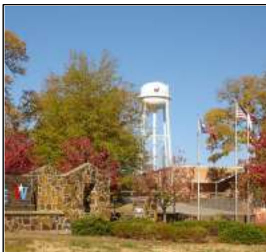
Image 4.1: The City's primary elevated storage tank as viewed from Main Street (above) and State Highway 110 (right). Whitehouse maintains two other elevated tanks located in the northern and southern portions of City's CCN area.

Three elevated storage tanks are maintained by the City both in and out of the City Limits, resulting in sufficient water pressure for urban development and fire protection. These facilities have a combined capacity of just under 1 million gallons. Three ground storage tanks are also maintained by the City with a combined