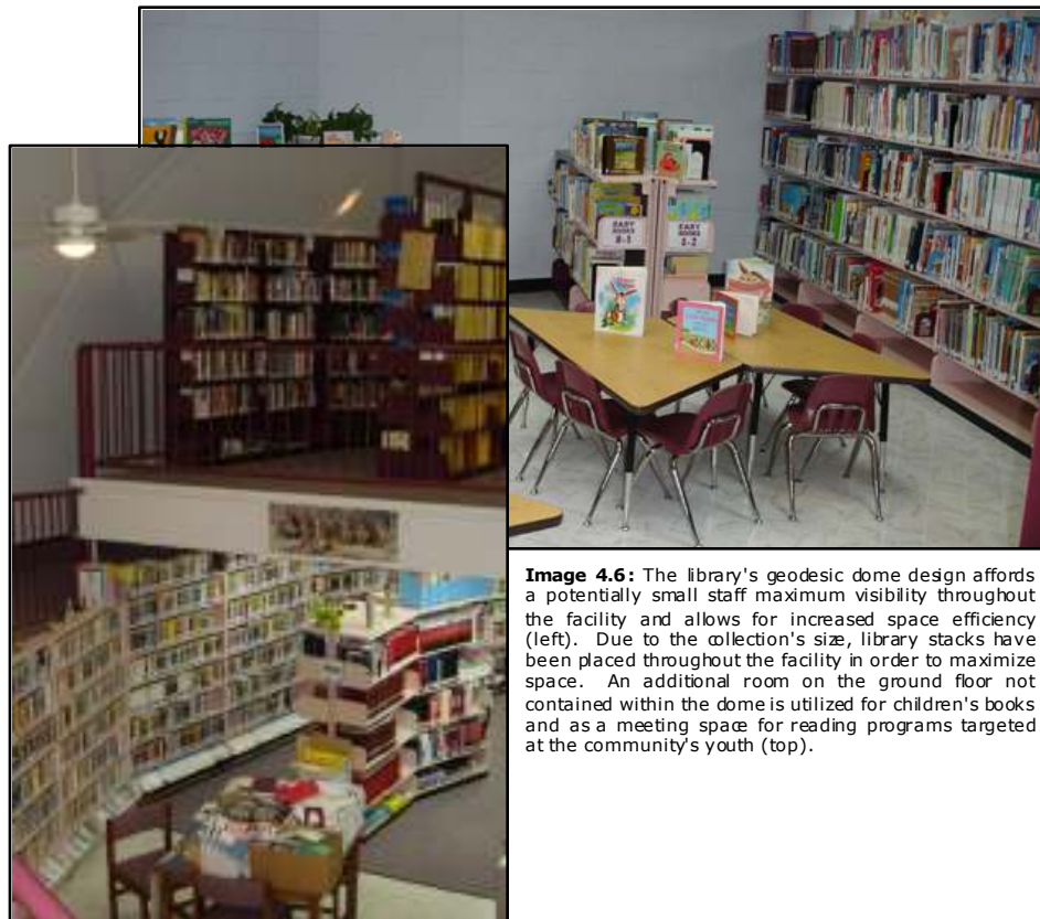
Image 4.6: The library's geodesic dome design affords a potentially small staff maximum visibility throughout the facility and allows for increased space efficiency (left). Due to the collection's size, library stacks have been placed throughout the facility in order to maximize space. An additional room on the ground floor not contained within the dome is utilized for children's books and as a meeting space for reading programs targeted at the community's youth (top).

The Whitehouse Community Library is located on land adjoining the City Park on Main Street, the City Hall complex, the YMCA, and other community facilities. The structure itself is a geodesic dome with just over five thousand square feet of usable space allowing for efficient staff operations and patron