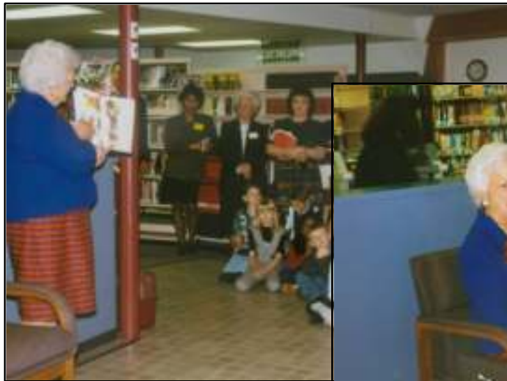
Image 4.7: Former First Lady Barbara Bush participated in a fund-raising campaign organized by the Whitehouse Community Library's librarian. Schoolchildren within the community competed with each other for the chance to listen to Mrs. Bush read several books at library. Proceeds from the competition's various fund-raising efforts were utilized to benefit several community programs.

wide variety of library patrons including young children and senior citizens. The Staff also participate in various community activities such as parades and Keep Whitehouse Beautiful. In addition to the existing summer reading program, the