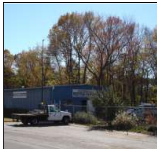
Image 4.4: City of Whitehouse Recycling Center

The City currently operates a recycling center which accepts unsorted post consumer waste including: cardboard, newsprint, mixed paper, aluminum, steel, and several types of plastic (Image 4.4). In addition to recycling, the center also processes yard waste and wood chips for composting. This product is available for free to citizens of the City. Once