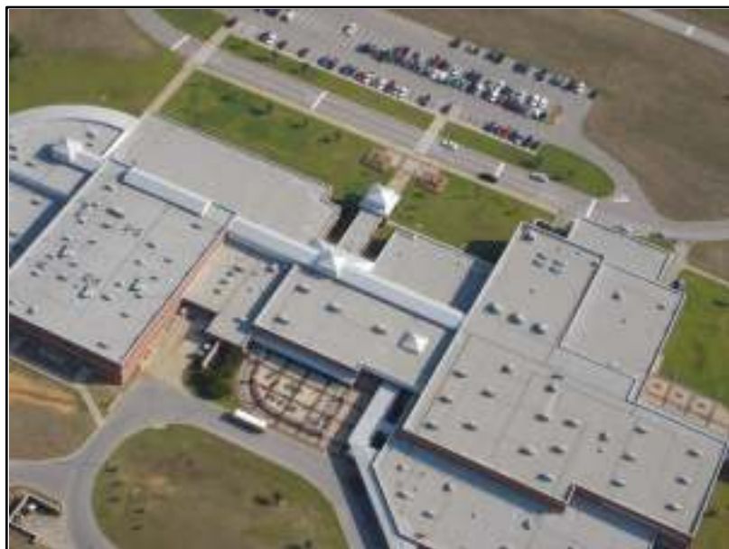
Image 4.10: Whitehouse High School

Whitehouse High School serves ninth through twelfth grade students. The school is the District's newest campus and includes modern facilities for both academics and a wide range of extracurricular disciplines (Image 4.10). During the 2005-2006 school year the fine arts