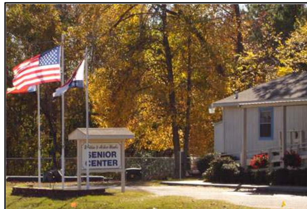
Image 4.3: Bobbie and Acker Hanks Senior Center

Whitehouse has partnered with a private organization to provide specialized services to senior citizens living within the community (Image 4.3). The Bobbie and Acker Hanks Senior Center provides a common location for retirees to socialize with each other. Seniors play bingo and dominos at the facility, as well as